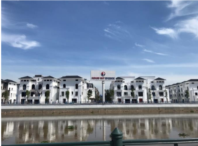
Hoang Huy Riverside Project

Projects of TCH “Hoang Huy Riverside” and “Golden Tower” have 495 housing products in total. Until now, the company has already sold 339 products with the prepayment of customers up to around VND900 billion. As planned, the products will be handed over to customers according to the actual progress of the next quarters in FY2019.