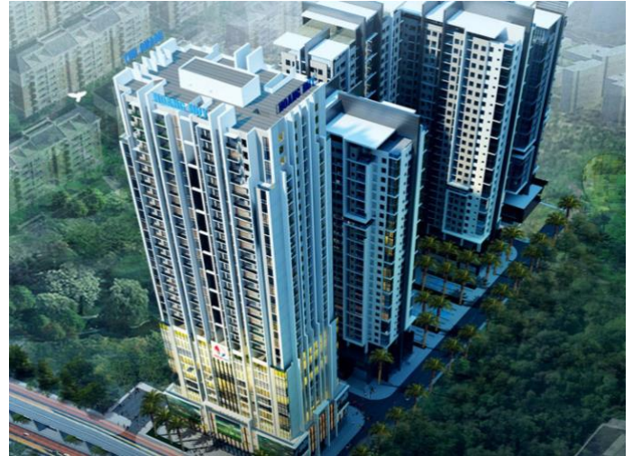
Golden Tower Project

It is forecasted that from the 2 nd quarter of FY2019, the revenue and profit from above-mentioned real estate projects will be recognized. This will help business result of the company to grow strongly in the upcoming reporting periods.